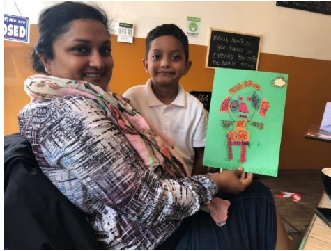
Residents doing crafts in Bedminster