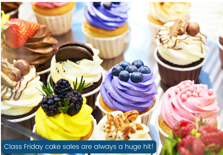
Class Friday cake sales are always a huge hit!

St John's is a wonderful school, and part of what makes it so great, is the community. Together, we can provide our children with fun and enriching activities, all whilst raising money to financially support the school.