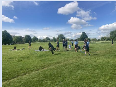
Year 6 Camp